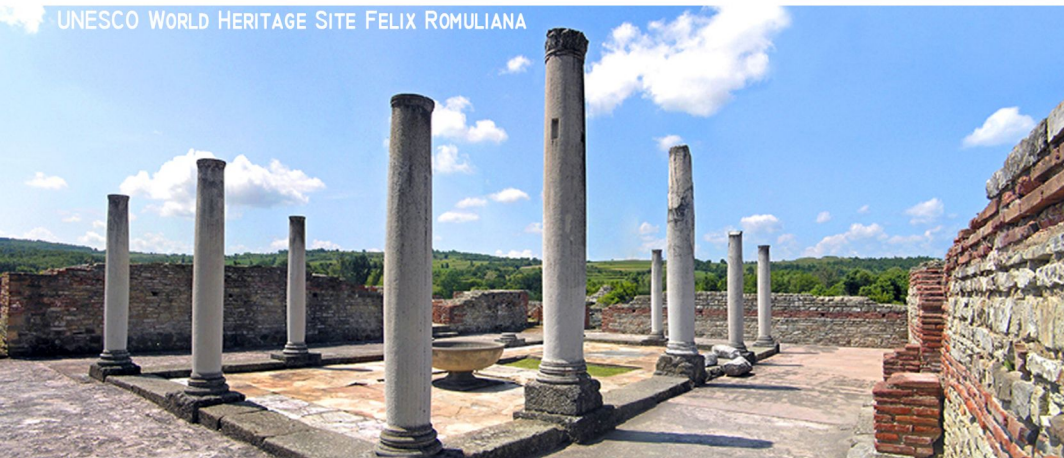
UNESCO WORLD HERITAGE SITE FELIX ROMULIANA

- ARCHEOLOGICAL TOURS: VISITS TO NUMEROUS ARCHEOLOGICAL SITES WAY BACK TO THE NEOLITHIC REMNANTS, THROUGH THE ROMAN SETTLEMENTS UP TO THE MIDDLE AGE MONASTERIES AND FORTRESSES;